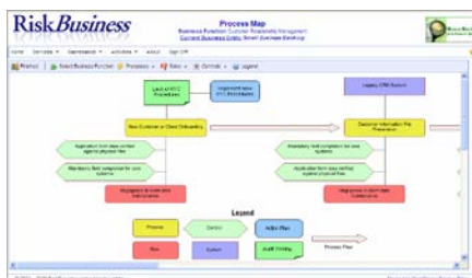
Sample of a Process Flow with Audit Findings and Action Plans

Audit Reports and individual audit findings can be maintained in a separate audit tracking tool, with individual audit findings imported into the RiskBusiness Internal Audit Service using the specifically provided software development kit, alternately the RiskBusiness Internal Audit Service can be used for all audit purposes. The RiskBusiness Internal Audit Service is web-based and uses PKI-technology to safe-guard the organisation's data. The Service also accepts file uploads in XML and csv formats to assist in data interchange.