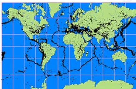
What is our exposure to earthquake?

As a subscriber to the Scenario Library, you can select those scenarios and scenario events which you use and flag these – in the same manner, on an anonymous basis, you can see which other scenarios and scenario events have been selected by other subscribers and how often each scenario or scenario event has been selected. You can also add your own scenarios and propose new scenarios for inclusion into the Scenario Library.